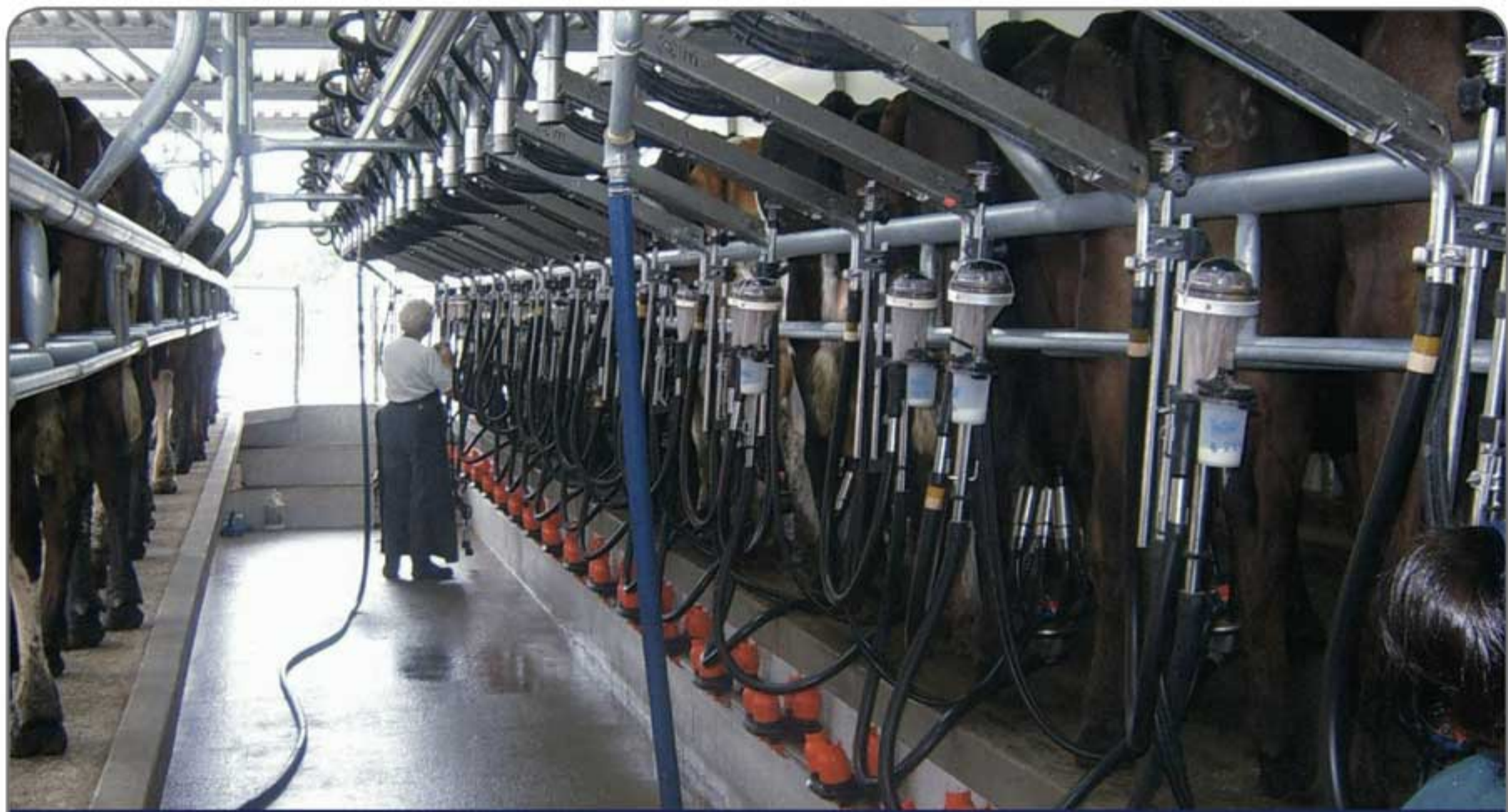
iNTELARM USED ON HERD TEST DAY WITH MECHANICAL MILK METERS