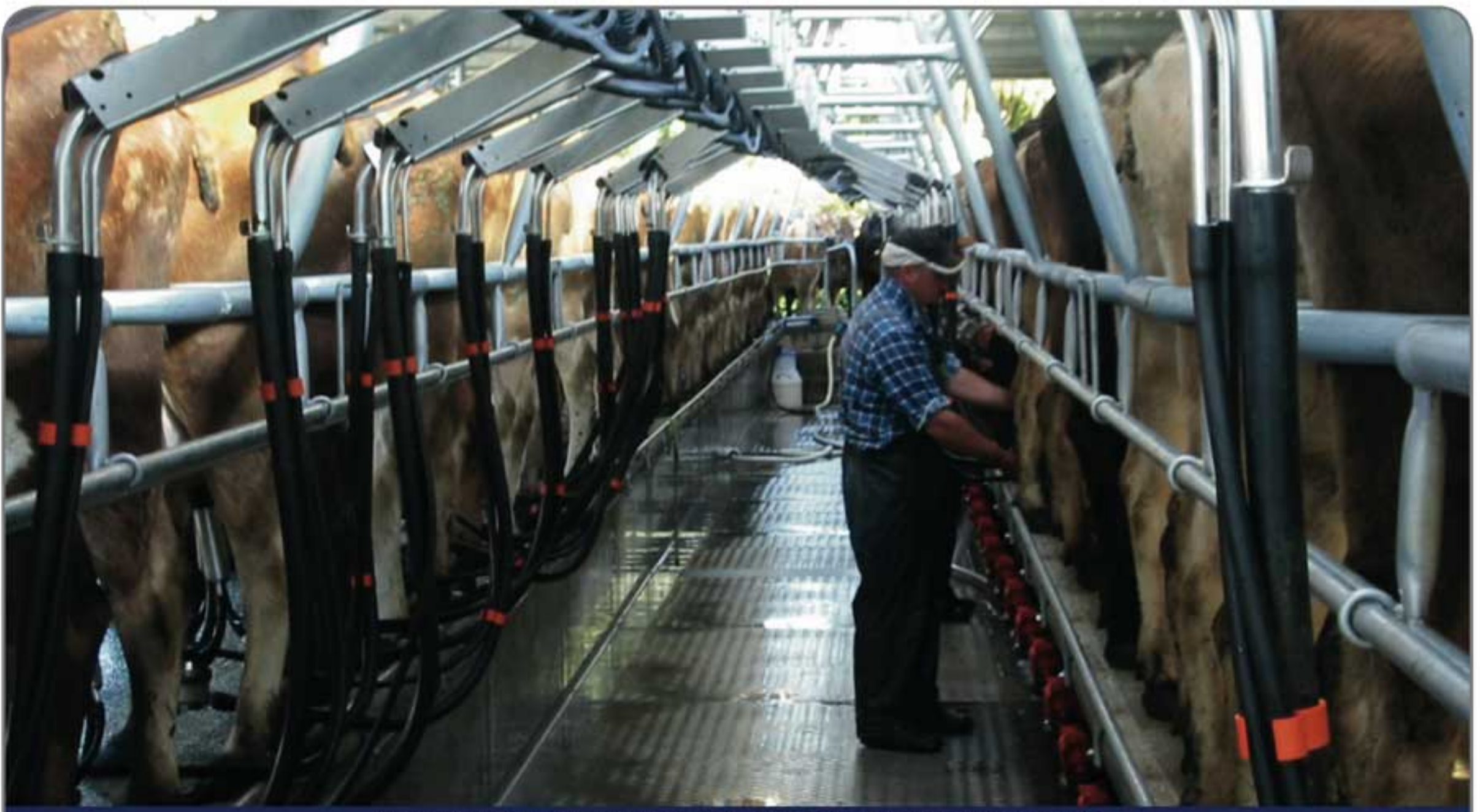
iNTELARM WITH INTELSCAN PLUS LEVEL 2 - SAFE MILKING WITH PULSATION ARREST